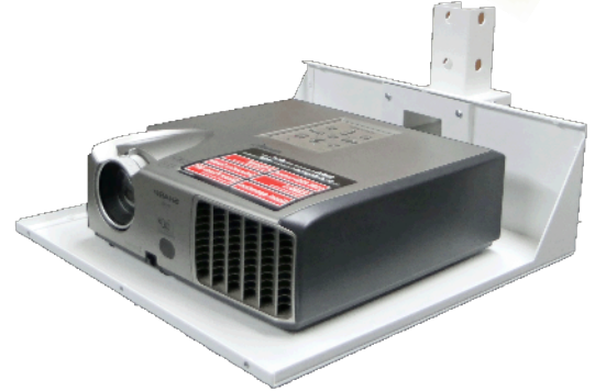
Projector Shelf Mounted to Unistrut®

A Flexible Design with every inch of space useable in two different versions Attachment to a 1½" Pole or to Unistrut® making it very easy to incorporate into any installation