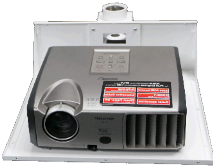
Projector Shelf Pole Mounted