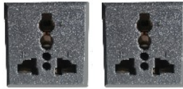
European Version replaces 2 outlet Standard USA receptacles for (2) World - Wide Receptacles For connection to all Overseas Plugs